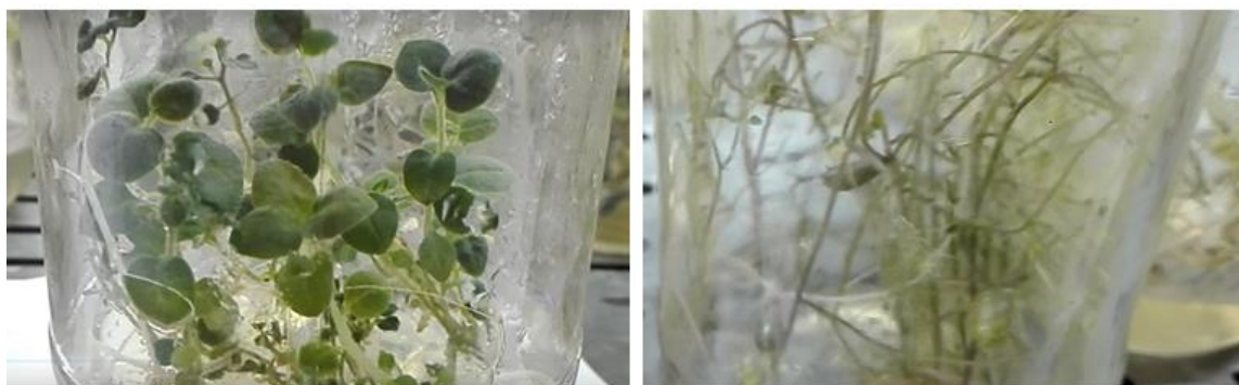
Fig. 1. The effect of silver ions (Ag-STS) on the growth of potato shoots. On the left side; the culture medium containing 10 mg/l silver thiosulphate (STS) and on the right side; without (STS).

Analyses of variance (ANOVA) of the completely randomized design (CRD) were performed on the collected data using SPSS software. The least significant difference test; L.S.D. was used at the level ( p \leq 0.05 ) to compare the mean values of the treatments; mean \pm SE of 20 replicates; n = 20 , (Snedecor and Cochran, 1980).