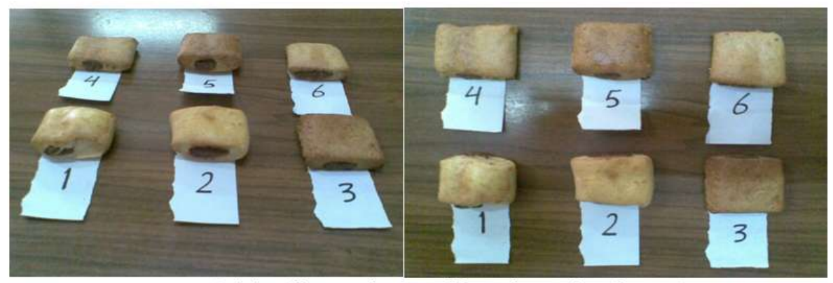
Fig (1):Different shapes of free gluten date bars pies.

Each value with the same column is followed by the same letters is not significant different at level of 0.05. 90-100 Very Good (V).80-89 Good (G).70-79 Satisfactory (S).Less Than 70 Questionable (Q).