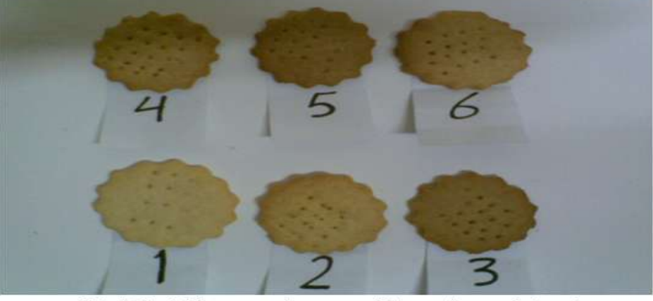
Fig (3): Different shapes of free gluten biscuit.

Each value with the same column is followed by the same letters is not significant different at level of 0.05. 90-100 Very Good (V).80-89 Good (G).70-79 Satisfactory (S).Less Than 70 Questionable (Q).